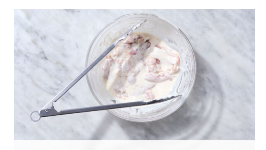
4. Batter chicken

Grease waffle iron with nonstick cooking spray. Following manufacturer instructions, cook waffles until goldenbrown, using half of the batter at a time. Keep waffles warm by placing on a wire rack in a preheated oven.