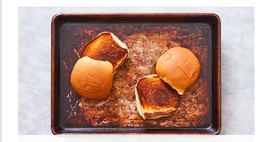
4. Toast buns

In a medium skillet, heat 2 teaspoons oil over medium-high. Add chicken ; cook, breaking up into large pieces, until browned and cooked through, 3-4 minutes. Add barbecue sauce ; bring to a simmer and cook, stirring occasionally, 1-2 minutes. Season to taste with salt and pepper .