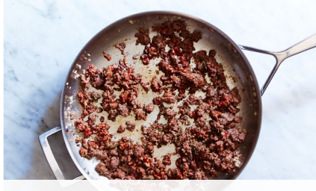
2. Brown beef

Bring a large pot of salted water to a boil. Finely chop 2 teaspoons garlic . Using kitchen shears, cut tomatoes in the can until finely chopped. Coarsely grate mozzarella on the large holes of a box grater. Finely grate Parmesan on the small holes of the grater. Break spaghetti in half.