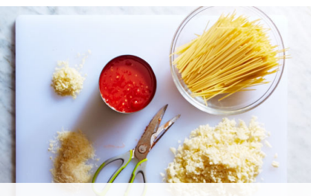
1. Prep ingredients

Calories 1070kcal, Fat 50g, Carbs 88g, Protein 58g