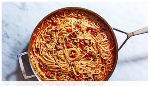
3. Finish sauce

Heat 2 tablespoons oil in a large ovenproof skillet over medium-high. Add chopped garlic ; cook, stirring, until fragrant, 1 minute. Add beef ; season with salt and pepper . Cook, breaking up into smaller pieces, until browned, 5-7 minutes. Spoon off any excess fat from skillet. Stir in ¼ cup tomato paste and 2 teaspoons Italian seasoning ; cook until fragrant, 1-2 minutes.