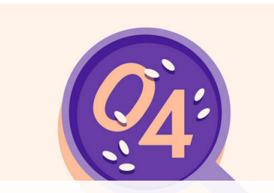
4. Make tahini sauce

In a medium bowl, combine Impossible patties, panko, remaining chopped garlic, 1 large egg, 1¼ teaspoons ras el hanout, and ½ teaspoon salt; knead to combine. Shape into 12 meatballs; place on a lightly oiled rimmed baking sheet. Broil on center oven rack until meatballs are browned and heated through, about 7 minutes (watch closely as broilers vary.