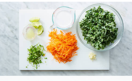
2. Prep ingredients

In a small saucepan, combine quinoa , ¾ cup water , and a pinch of salt . Bring to a boil. Reduce heat to low, cover, and cook until water is absorbed and quinoa is tender, about 15 minutes. Keep covered until ready to serve.