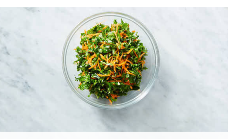
3. Season carrot-kale slaw

Squeeze 1 tablespoon lime juice into a small bowl; cut remaining lime into wedges. Finely chop 1 teaspoon garlic . Remove stems from half of the kale ; roll leaves together and thinly slice crosswise (save rest for own use). Coarsely grate carrot . Coarsely chop cilantro leaves and stems . In a second small bowl, whisk to combine coconut milk powder and ¾ cup hot tap water .