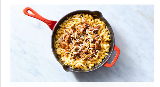
4. Make mac & cheese

Add 1 teaspoon oil and remaining scallions to skillet. Cook, stirring, until fragrant, about 1 minute. Add ¼ cup water and bring to a simmer, scraping up bits from the bottom of the pan. Add to bowl with beef. Stir in barbecue sauce until evenly coated.