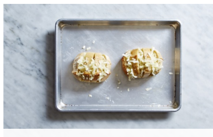
2. Make pull-apart bread

Preheat oven to 425°F. Finely chop half of the onion . Reserving liquid , drain chickpeas . Pick and chop 1 tablespoon thyme leaves (save rest for own use). Finely grate 1 teaspoon lemon zest into a small bowl, then squeeze in 1 tablespoon juice . Pat chicken dry; season all over with salt and pepper .