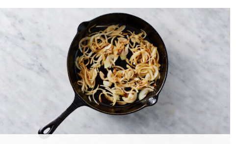
3. Cook onions

Heat 1 tablespoon oil or butter in a medium skillet over medium-high. Add 1 tortilla and cook until warm and lightly golden, about 30 seconds per side; transfer to a plate. Repeat with remaining tortillas, wrapping in foil or a clean kitchen towel as you go to keep warm.