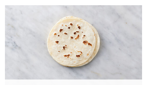
2. Warm tortillas

Using your hands, break up beef into bite-sized pieces.