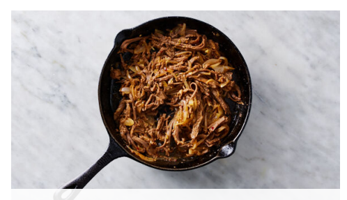
4. Cook barbacoa beef

Heat 1 tablespoon oil in same skillet over medium-high. Add sliced onions and cook, stirring occasionally, until softened and browned in spots, about 5 minutes.