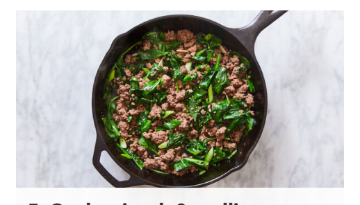
5. Cook spinach & scallions

Meanwhile, add noodles to boiling water. Cook, stirring, until al dente, about 3-5 minutes. Drain, rinse with cold water , and drain again.