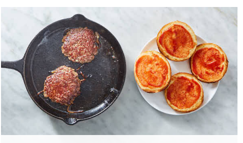
3. Toast buns

In a small bowl, combine all of the sour cream and half of the ranch seasoning (save rest for own use). Thin with water , 1 teaspoon at a time, to reach desired consistency. Season to taste with salt and pepper .