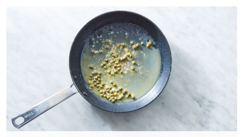
5. Make sauce

Transfer chicken cutlets to a paper towellined plate and season lightly with salt and pepper .