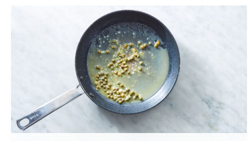
5. Make sauce

Transfer chicken cutlets to a paper towellined plate and season lightly with salt and pepper .