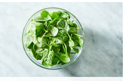
3. Make salad dressing

Meanwhile, in a small bowl, stir to combine mayonnaise and Sriracha .