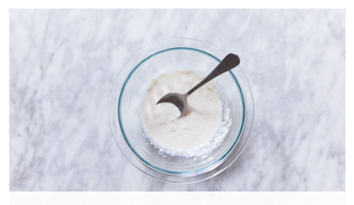
3. Make horseradish mayo

Trim scallions, then thinly slice. Trim ends from celery; halve lengthwise, then thinly slice crosswise. In medium bowl, stir to combine 2 teaspoons mustard, 2 tablespoons oil, 1 tablespoon vinegar, and a pinch each of sugar, salt, and pepper. Add potatoes, celery, and scallions to bowl with dressing; stir to combine. Season to taste with salt and pepper.