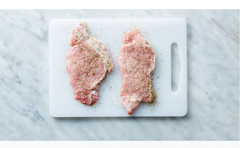
3. Prep pork chops

Add potatoes to boiling water. Cook over medium-high heat until barely tender when pierced with the tip of a knife, 6-8 minutes. Add carrots to the saucepan and continue to cook potatoes and carrots together until both are tender, 5-7 minutes more. Drain vegetables, shaking out excess water, and return to saucepan. Set aside until step 4.