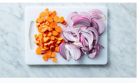
1. Prep ingredients

Calories 810kcal, Fat 49g, Carbs 46g, Protein 44g