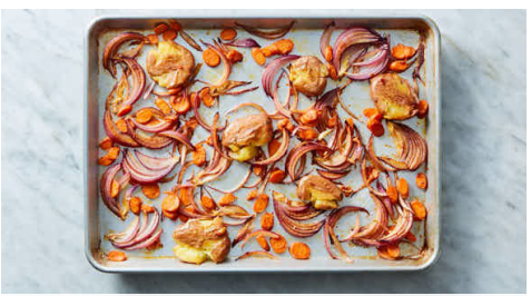
4. Roast potatoes & carrots

While veggies cook , pat pork chops dry and trim any excess fat to ¼-inch. Place pork between sheets of plastic wrap. Using a meat mallet (or heavy skillet), pound pork to an even ¼-inch thickness; season all over with 2 teaspoons za'atar spice and a generous pinch each of salt and pepper . Let sit until step 6.