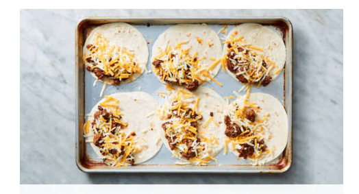
4. Assemble quesadillas

Heat 1 tablespoon neutral oil in a medium skillet over high. Add beef ; cook, breaking up into smaller pieces, until cooked through and browned in spots, 4-5 minutes. Stir in remaining chopped garlic; cook until fragrant, about 1 minute. Add glaze; cook, scraping up browned bits from bottom of skillet, until beef is coated and skillet is mostly dry, 1-2 minutes. Season to taste.