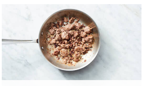
3. Brown beef

In a 2nd small bowl, stir to combine remaining gochujang and tamari, 3 tablespoons water, 1 tablespoon sugar, and 1 teaspoon sesame oil. Set glaze aside until step 3.