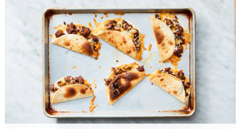
5. Broil quesadillas

Brush one side of each tortilla generously with neutral oil . Arrange tortillas on a rimmed baking sheet, oiled side down. Divide beef mixture among tortillas, spooning filling onto 1 half of each tortilla, then top with shredded cheddar-jack cheese. Fold in half to close.