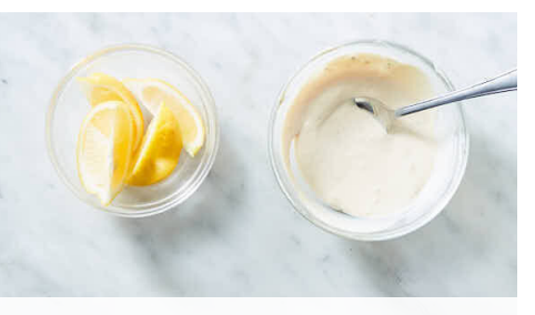
3. Make tahini sauce

Trim scallions, then thinly slice. Coarsely chop parsley leaves and stems. Cut tomatoes into ½-inch pieces. Peel cucumber; halve and scoop out seeds, halve lengthwise, then cut into ¼-inch thick pieces. In a medium bowl, combine tomatoes, cucumbers, 2 tablespoons oil, 1 teaspoon vinegar, and ½ teaspoon sumac; stir to combine. Season to taste with salt and pepper.