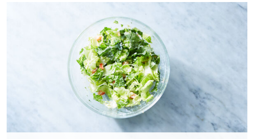
5. Make salad

Broil on upper oven rack until meatballs are warmed through and cheese is just starting to brown, 2-4 minutes (watch closely).