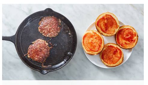
3. Toast buns

In a small bowl, combine all of the sour cream and half of the ranch seasoning (save rest for own use). Thin with water , 1 teaspoon at a time, to reach desired consistency. Season to taste with salt and pepper .