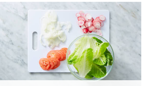
1. Prep ingredients

Calories 760kcal, Fat 47g, Carbs 43g, Protein 36g