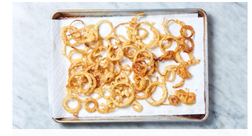
5. Fry onion rings

Broil on upper oven rack until well browned in spots and crispy, stirring halfway through, 8-10 minutes (watch closely as broilers vary). Add half of the barbecue sauce and 1 tablespoon water , tossing to coat.