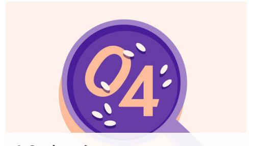
4. Cook apricot pan sauce

Once carrots have roasted for 15 minutes, transfer seared chicken from skillet to same baking sheet. Continue to roast on center oven rack until chicken is cooked through and carrots are browned and tender, 6–10 minutes. Transfer chicken to a cutting board to rest. Set baking sheet with carrots aside until ready to serve.