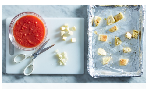
1. Prep ingredients

Calories 900kcal, Fat 67g, Carbs 39g, Protein 43g