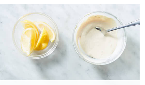
3. Make tahini sauce

Trim scallions, then thinly slice. Coarsely chop parsley leaves and stems. Cut tomatoes into ½-inch pieces. Peel cucumber; halve and scoop out seeds, halve lengthwise, then cut into ¼-inch thick pieces. In a medium bowl, combine tomatoes, cucumbers, 2 tablespoons oil, 1 teaspoon vinegar, and ½ teaspoon sumac; stir to combine. Season to taste with salt and pepper.