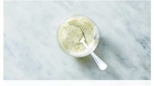
6. Make sauce & serve

Shape beef into 2 (4-inch) patties, then season all over with salt and pepper . Heat 2 teaspoons oil in same skillet over medium-high. Add burgers and cook until browned on the bottom, 2-3 minutes. Flip burgers, then top each with cheese . Cover and cook until cheese is melted and burgers are medium-rare, 2-3 minutes (or longer if desired).