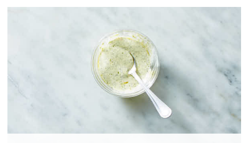
6. Make sauce & serve

Shape turkey into 2 (4-inch) patties, then season all over with salt and pepper . Heat 2 teaspoons oil in same skillet over medium-high. Add burgers and cook until browned on the bottom, 4-5 minutes. Flip burgers, then top each with cheese . Cover and cook until cheese is melted and burgers are cooked through, 4-5 minutes.