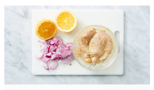
3. Prep chicken

Set bean and corn salad aside until step 6.