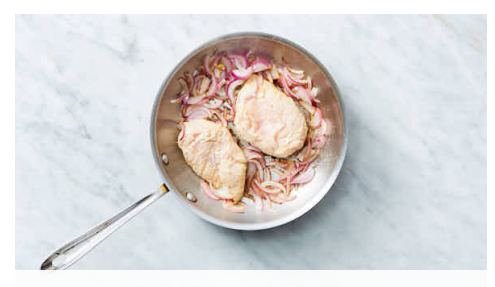
4. Brown chicken & onions

To bowl with mayonnaise, stir in 2 teaspoons each of cumin and salt and a few grinds of pepper. Pat chicken dry, then add to mayonnaise mixture and turn well to coat.