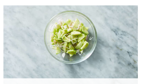
3. Pickle cucumbers

Coarsely chop cilantro leaves and stems .