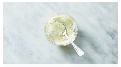
6. Make sauce & serve

Shape beef into 2 (4-inch) patties, then season all over with salt and pepper . Heat 2 teaspoons oil in same skillet over medium-high. Add burgers and cook until browned on the bottom, 2-3 minutes. Flip burgers, then top each with cheese . Cover and cook until cheese is melted and burgers are medium-rare, 2-3 minutes (or longer if desired).