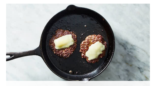
5. Cook burgers

Lightly brush cut sides of buns with oil . Heat a medium skillet over medium-high. Add buns, oiled sides down, and toast until lightly browned, 1-2 minutes (watch closely). Transfer buns to plates. Coarsely chop all of the cheese .