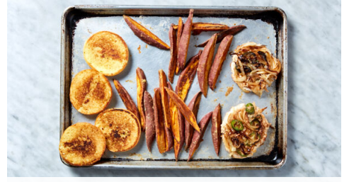
5. Finish burgers

Heat reserved skillet over medium-high. Add chicken patties, then top with jalapeños and half of the sliced onions , Cook until the bottom is starting to brown, about 2 minutes, then press with a spatula to flatten into 5-inch wide burgers. Cook, undisturbed, until well browned on the bottom, 2-3 minutes more.