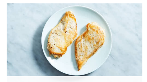
4. Cook chicken

To saucepan with orzo , add 1 ½ cups water and ½ teaspoon salt ; bring to a boil. Reduce heat to low, cover, and simmer until orzo is tender and liquid is mostly evaporated, about 18 minutes. Remove saucepan from heat, then immediately add spinach (no need to stir). Cover and set aside to wilt spinach.