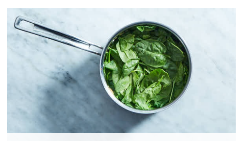
3. Cook pilaf

Heat 1 tablespoon oil in a small saucepan over medium-high. Add half of the chopped shallots and cook, stirring, until golden, 1-2 minutes. Add orzo and cook, stirring, until deep golden-brown, 2-3 minutes.