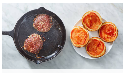
3. Toast buns

In a small bowl, combine all of the sour cream and half of the ranch seasoning (save rest for own use). Thin with water , 1 teaspoon at a time, to reach desired consistency. Season to taste with salt and pepper .