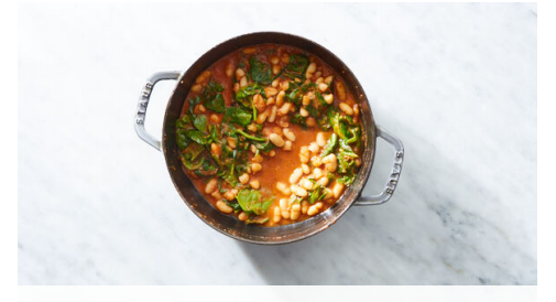
5. Simmer beans & spinach

Heat 1 tablespoon oil in same skillet over medium-high. Add meatballs and cook, turning as they brown, until seared, 6-8 minutes. Drain excess oil and reduce heat to medium; add marinara and 1/4 cup water . Simmer, turning meatballs every minute or so, until cooked through, 3-5 minutes. Transfer meatballs to a plate and cover to keep warm.