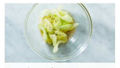
5. Marinate celery

Bring to a boil over high heat and stir to combine. Reduce heat to medium-high and let simmer vigorously, stirring frequently to prevent sticking and for even cooking, until pasta is all dente and liquid is reduced to a sauce that coats the pasta, 12-15 minutes. Sauce should be thick and glossy.