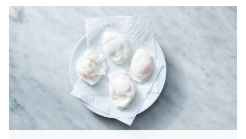
5. Poach eggs

Roast pork and kale on center oven rack until kale is tender and pork is browned in spots, 8-10 minutes. Finely grate 1 teaspoon lemon zest into a small bowl, then cut lemon into wedges. Finely chop 1 teaspoon garlic and dill fronds and stems . To bowl with zest, add garlic and dill . Sprinkle half of the gremolata over ingredients on baking sheet.