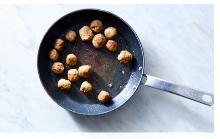
3. Cook meatballs

Add pasta to boiling salted water and cook, stirring occasionally to prevent sticking, until al dente, 7-8 minutes. Reserve <sup>1</sup>/<sub>3</sub> cup cooking water . Carefully drain pasta over spinach in colander to wilt slightly.