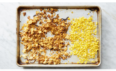
4. Broil chicken & corn

Preheat broiler with a rack in the top position.