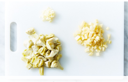
2. Prep ingredients

Meanwhile, finely chop 2 teaspoons garlic. Drain half of the artichokes and coarsely chop (save rest for own use). Cut mozzarella into ½-inch cubes.