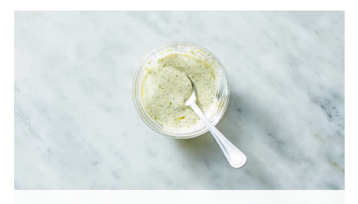
6. Make sauce & serve

Shape turkey into 2 (4-inch) patties, then season all over with salt and pepper . Heat 2 teaspoons oil in same skillet over medium-high. Add burgers and cook until browned on the bottom, 4-5 minutes. Flip burgers, then top each with cheese . Cover and cook until cheese is melted and burgers are cooked through, 4-5 minutes.