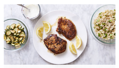
6. Season yogurt & serve

Crumble feta into a medium bowl, then add mint , bulgur , lemon zest , remaining lemon juice , and 2 teaspoons oil ; stir to combine. Season to taste with salt and pepper .