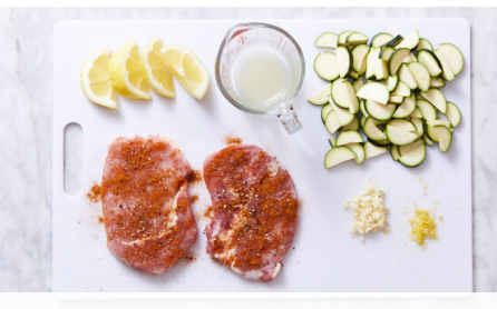
2. Prep ingredients

Drain in a fine-mesh sieve, then let sit in sieve to cool, fluffing occasionally with a fork, until step 5.