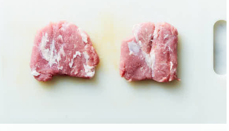
3. Pound pork

In a large bowl, whisk to combine the chopped ginger, all of the tamari, 1 tablespoon vinegar, 2 teaspoons sugar, and 3 tablespoons oil.