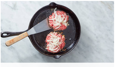
2. Cook burgers

Add all but 2 lettuce leaves and toss to coat.