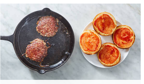
3. Toast buns

In a small bowl, combine all of the sour cream and half of the ranch seasoning (save rest for own use). Thin with water , 1 teaspoon at a time, to reach desired consistency. Season to taste with salt and pepper .