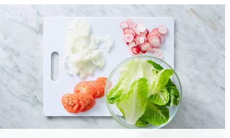
1. Prep ingredients

Calories 700kcal, Fat 35g, Carbs 43g, Protein 38g