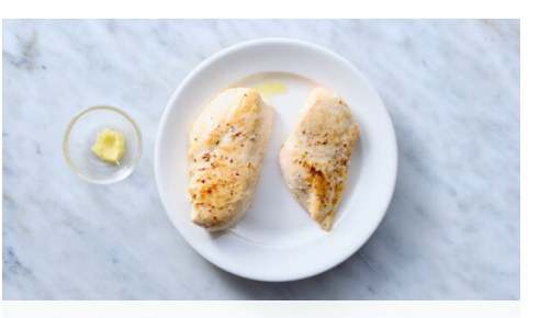
3. Cook chicken

In a small saucepan, combine rice , 1¼ cups water , and ½ teaspoon salt , bring to a boil over high heat. Cover and cook over low until rice is tender and water is absorbed, about 17 minutes. Remove from heat. Keep covered until ready to serve.