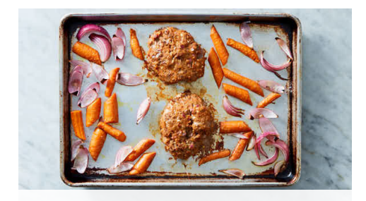
4. Roast meatloaf & veggies

To bowl with grated garlic, add beef, Dijon, chopped thyme leaves, finely chopped onions, ½ cup panko, 1 large egg, 2 tablespoons of the Worcestershire sauce, 2 tablespoons ketchup, ½ teaspoon salt, and a few grinds of pepper. Mix gently to combine, and then shape beef into into 2 equal-size ovals.