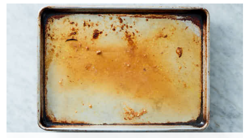
5. Make gravy

Add carrots and onions to a rimmed baking sheet. Toss with 1 tablespoon oil ; season with salt and pepper . Push vegetables to outer edges of baking sheet; place meatloaves in center. Bake on upper oven rack until meatloaves reach an internal temperature of 165°F and vegetables are tender, 20-22 minutes. Transfer meatloaves and vegetables to a plate; cover to keep warm.