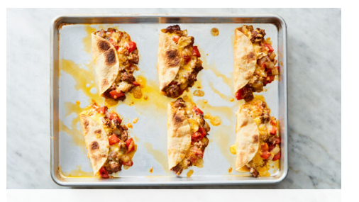
6. Broil & serve

Brush one side of each tortilla generously with neutral oil . Arrange tortillas on a rimmed baking sheet, oiled side down. Divide chicken mixture among tortillas, spooning filling onto 1 half of each tortilla, then top with shredded cheddar-jack cheese . Fold in half to close. Transfer to a baking sheet in a single layer.