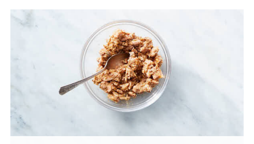
2. Season chicken

Preheat oven to 450°F with a rack in the center. Scrub potato , then cut into ¼-inch thick wedges. Halve onion , then cut into ¼-inch thick wedges through the root end. Transfer veggies to a rimmed baking sheet and toss with 1 tablespoon oil ; season with salt and pepper . Roast on center oven rack until just tender and browned in spots, 15-17 minutes.