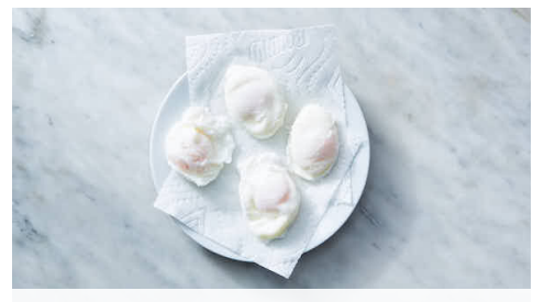
5. Poach eggs

Roast chicken and kale on center oven rack until kale is tender and chicken is browned in spots, 8-10 minutes. Finely grate 1 teaspoon lemon zest into a small bowl, then cut lemon into wedges. Finely chop 1 teaspoon garlic and dill fronds and stems . To bowl with zest, add garlic and dill . Sprinkle half of the gremolata over ingredients on baking sheet.