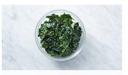
3. Prep kale

In a medium bowl, use your fingers to break shredded chicken into bite-sized pieces; season with all of the pastrami spice, 1 tablespoon oil , and 1 teaspoon sugar ; stir gently to coat. Transfer chicken to a plate.