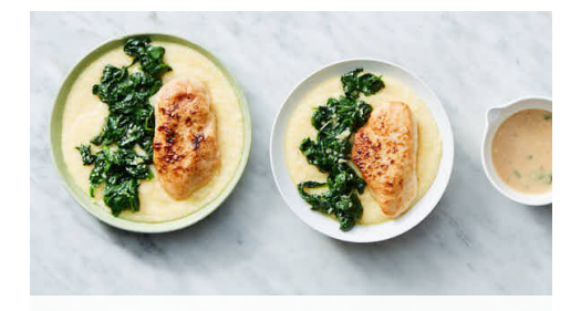
6. Finish & serve

To same skillet, add remaining garlic, 1 tablespoon butter, and 1 teaspoon flour. Cook, stirring, over medium heat until fragrant, 30 seconds. Stir in broth; bring to a simmer. Cook until thickened, 1 minute. Reduce heat to low; stir in parsley, 1 tablespoon butter, and 1-2 teaspoons lemon juice (depending on taste preference). Season to taste with salt and pepper.