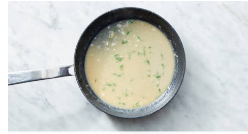
5. Make sauce

Heat 1 tablespoon oil in same skillet over medium-high. Add chicken and cook until golden brown and cooked through, 3-4 minutes per side. Transfer chicken to a plate.