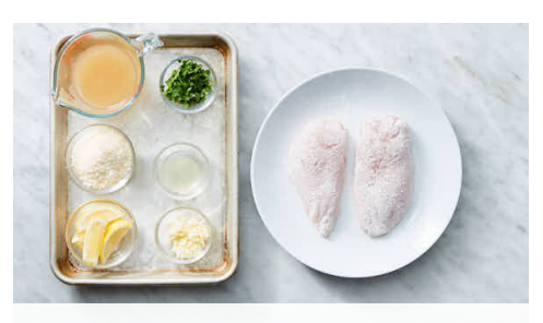
2. Prep ingredients

In a medium saucepan, bring 2% cups water and 1 teaspoon salt to a boil. Gradually whisk polenta into boiling water; return to a boil. Cover, reduce heat to low, and cook, whisking occasionally, until grains are tender and polenta is thickened, 8-10 minutes. Remove from heat and keep covered until ready to serve.