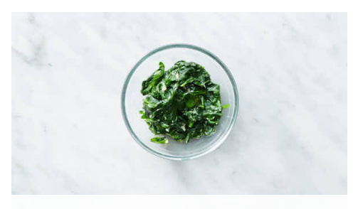
3. Sauté spinach

Pick and coarsely chop parsley leaves; discard stems. Finely grate Parmesan. Finely chop 1 tablespoon garlic. Squeeze 2 teaspoons lemon juice into a small bowl; cut any remaining lemon into wedges. Pat chicken dry; season with salt and pepper. Lightly coat each breast with 1 teaspoon flour. In a measuring cup, combine broth concentrate and ½ cup water.