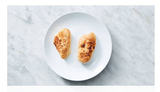
4. Cook chicken

Heat 1 tablespoon oil in a medium skillet over medium-high. Add spinach and half of the chopped garlic ; cook, stirring, until spinach is just wilted. Season with a pinch each of salt and pepper . Transfer to a bowl and cover to keep warm.