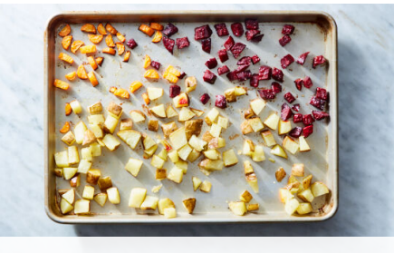
2. Roast veggies

Cut potatoes into ½-inch pieces. Halve carrot lengthwise and then cut crosswise into ½-inch thick half-moons. Peel beet and cut into ½-inch pieces.