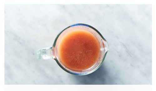
3. Make sauce

In a medium bowl, combine 1 large egg, ¼ cup panko, 1 teaspoon of the chopped garlic, ½ teaspoon salt, and ¼ teaspoon pepper. Let sit for 5 minutes for panko to absorb the egg. Add beef and knead or stir to combine. Using slightly moistened hands, form mixture into 10 equal-sized meatballs. Set aside until step 5.