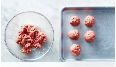
2. Prep meatballs

Finely chop 1 tablespoon garlic . Peel potatoes , then cut into 1-inch pieces. Bring a medium saucepan of salted water to a boil; cover to keep warm over low heat until step 4.