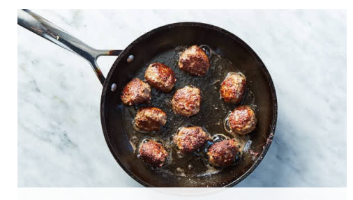
5. Brown meatballs

Add potatoes and 1 teaspoon of the chopped garlic to saucepan with boiling water; cook until tender, 7-9 minutes. Add peas and cook, 2 minutes. Reserve 3 tablespoons cooking water then drain. Return potatoes, peas, and garlic to saucepan. Add 1 tablespoon butter and coarsely mash. Add 1 tablespoon reserved cooking water as needed to loosen. Cover to keep warm over low heat.