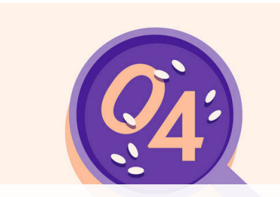
4. Prep toppings & serve

To same pot, add beans and their liquid , tomato sauce , 1½ cups water , 1 teaspoon salt , and ½ teaspoon pepper . Bring to a boil over high. Reduce heat to medium-low and partially cover with a lid or foil. Simmer, stirring occasionally, until thickened to a rich stew-like consistency, about 30 minutes. Season to taste with salt and pepper .