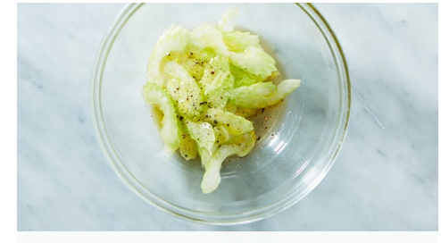
5. Marinate celery

Bring to a boil over high heat and stir to combine. Reduce heat to medium-high and let simmer vigorously, stirring frequently to prevent sticking and for even cooking, until pasta is all dente and liquid is reduced to a sauce that coats the pasta, 12-15 minutes. Sauce should be thick and glossy.