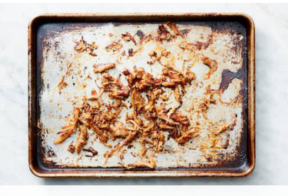
3. Cook chicken

Fluff rice and divide between bowls. Serve with chicken , carrots , marinated cucumbers , and scallions over top. Drizzle chicken with remaining hoisin sauce . Garnish with cilantro and peanuts . Serve with lime wedges .